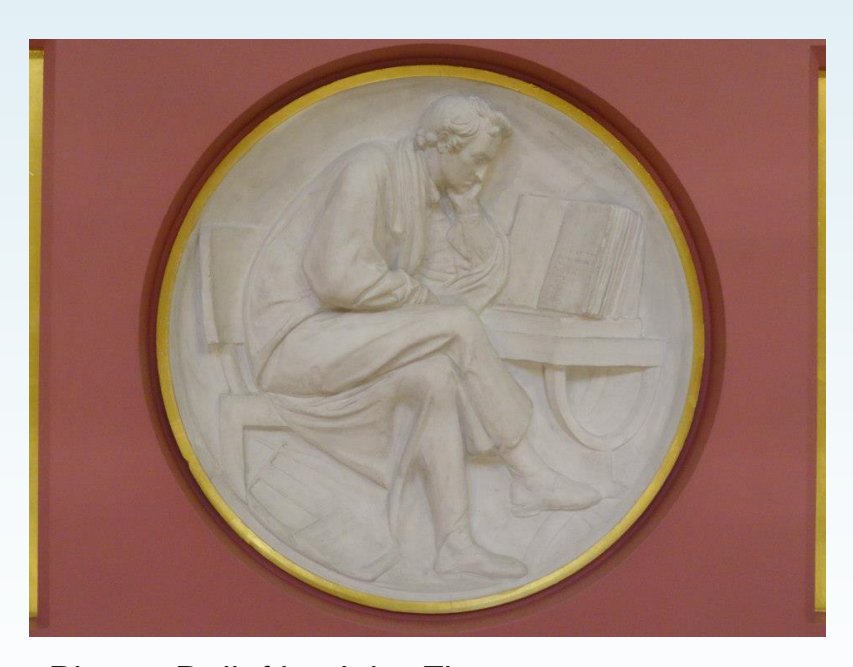
Plaster Relief by John Flaxman, Flaxman Gallery, UCL