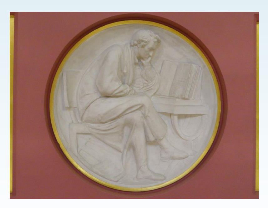
Plaster Relief by John Flaxman, Flaxman Gallery, UCL