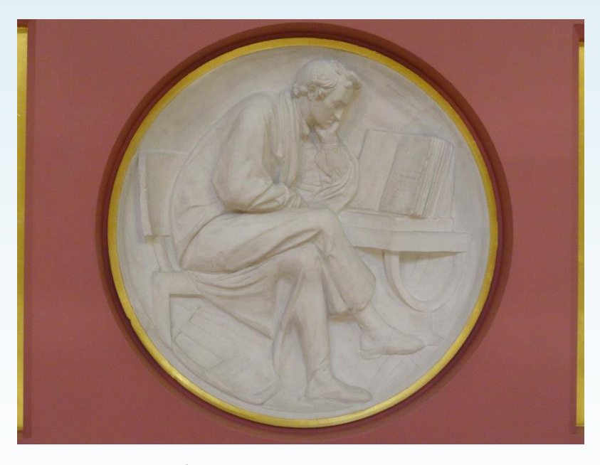
Plaster Relief by John Flaxman, Flaxman Gallery, UCL