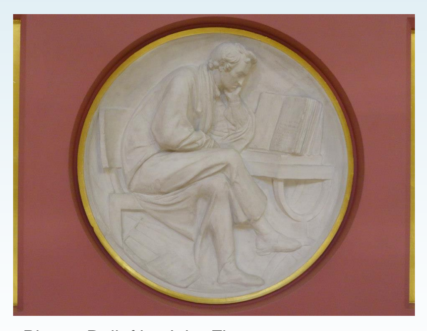
Plaster Relief by John Flaxman, Flaxman Gallery, UCL