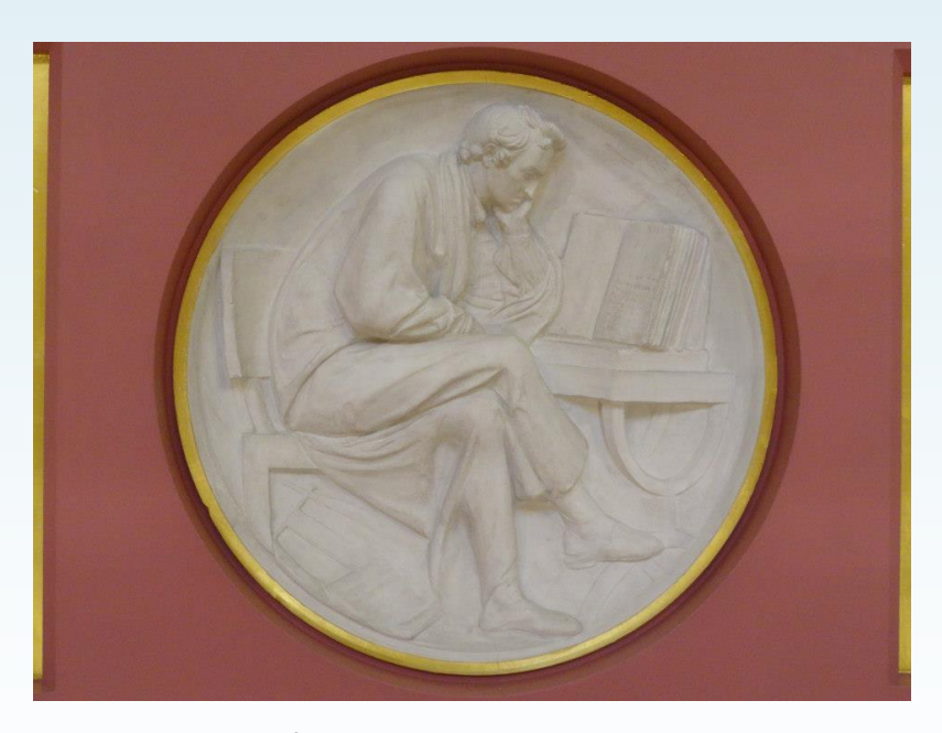
Plaster Relief by John Flaxman, Flaxman Gallery, UCL