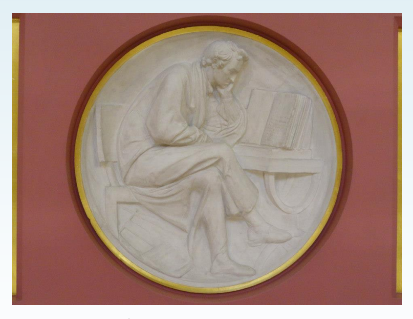
Plaster Relief by John Flaxman, Flaxman Gallery, UCL