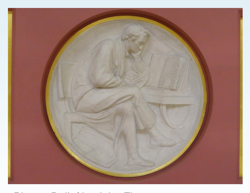
Plaster Relief by John Flaxman, Flaxman Gallery, UCL