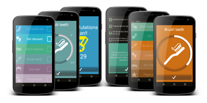
Figure 1: The MOBERO mobile system. Left, the morning module. Right, the bedtime module.

MOBERO (presented in more detail in [23]) is a mobile application that assists parents and children with ADHD to establish healthy morning and bedtime routines, as these situations can often cause frustration [8,19]. We designed and developed MOBERO through an iterative design process involving parents, children with ADHD and ADHD domain professionals as described in [23]. As ADHD is highly heritable [3] and because we learned from our empirical studies that parents' engagement was critical in changing children's morning and bedtime routines, we included routines for parents as well as children in MOBERO [23].