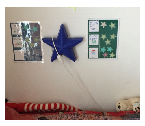
Figure 2: Two A4-sized paper reward charts placed above a child's bed. The child and parents agree on a reward, which the child then draws in the "white boxes". When the child has collected the amount of stars that each reward is worth (two, three, or four stars) the child has earned the reward.

laminated A4-sized paper chart as seen on Figure 2 and further described in [23].