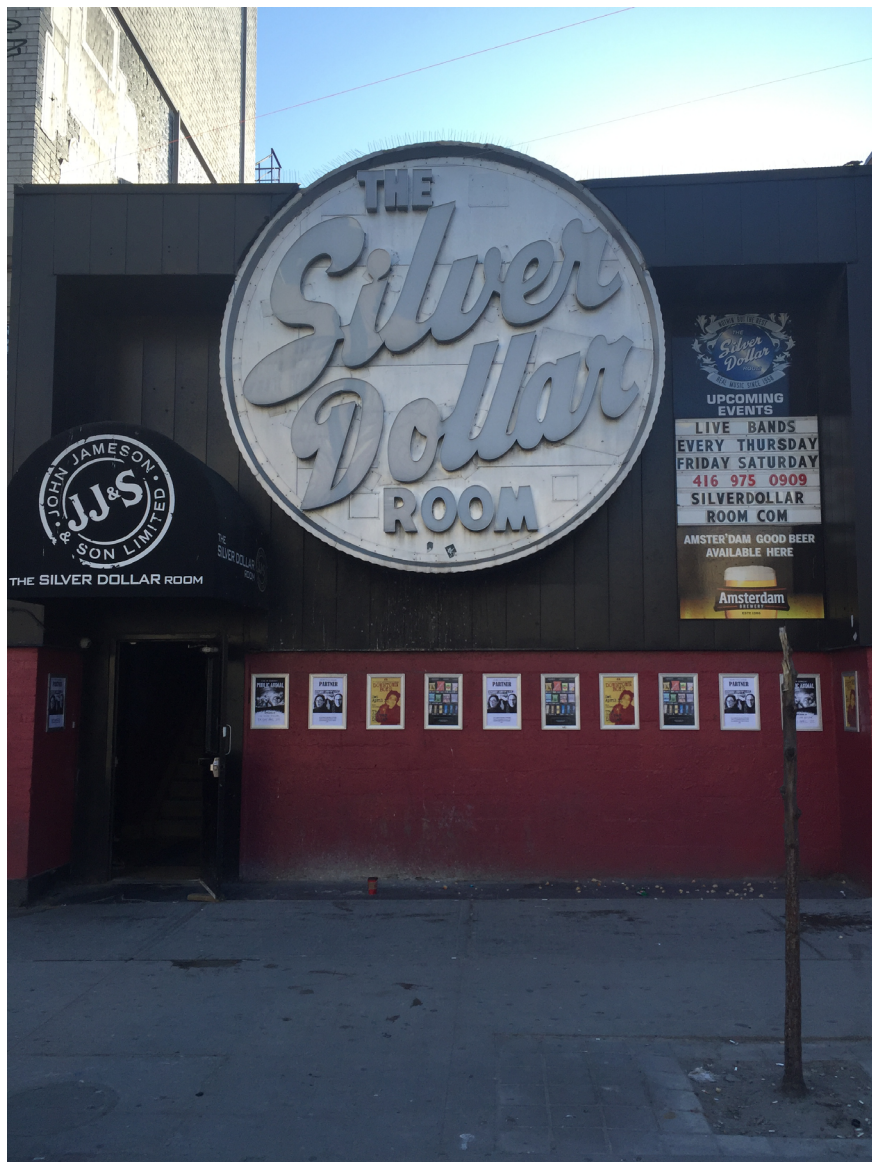
Figure 3. Exterior of the Silver Dollar Room, with its iconic sign.

The Silver Dollar Room is located on the west side of Spadina Avenue, just north of College Street, in Toronto, Ontario, attached to the side of the