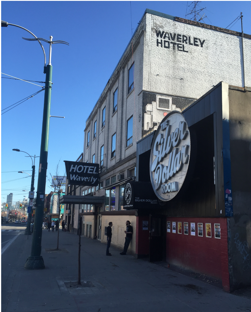
Figure 1. The Silver Dollar Room block, where the venue is located beside the Hotel Waverly.

On January 13, 2015, one of Toronto, Canada's, iconic live music venues, the Silver Dollar Room, officially received cultural heritage designation pursuant to the City of Toronto By-law 57-2015 under Part IV, Section 29 of the Ontario Heritage Act (OHA). 5