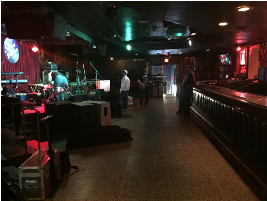
Figure 2. Interior of the Silver Dollar Room, viewed from the rear of the venue. The bar is on the right side and the stage is on the left. The center part is generally where the audience stands during live music performances. In this photo, a band is setting up their performance space for later that night.

Protecting Toronto's live music venues, such as the Silver Dollar Room, from redevelopment projects and the gentrification of spaces is integral to the flourishing of Toronto's live music culture and nighttime arts scene in the city, and for the sustenance of this intangible element of Toronto's modern cultural heritage. Where legal frameworks govern the everyday experience of culture in the city through provincial and municipal zoning and planning decisions by bodies like the Ontario Municipal Board (OMB) and Toronto City Council, it is important to study how they manifest, or, as Valverde describes, "the microdetails of the governance process, rather than ... the big-picture outcomes." 26