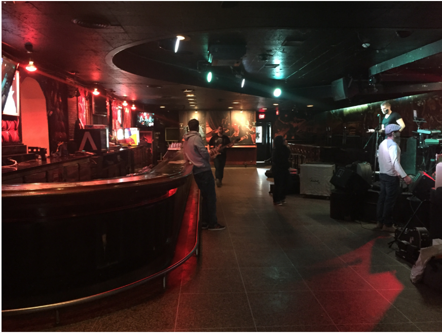
Figure 5. Interior of the Silver Dollar Room viewed from the entrance side of the space. The bar area is to the left, and the stage is to the right. In this photo a band is setting up its performance space for later that night.

status designation of the Silver Dollar Room led to encouraging results for its future and the preservation of its intangible cultural heritage and high generated use-value. 77 The new development will involve the heritage restoration and maintenance of the current space of the Silver Dollar Room as well as its iconic sign, and will also be constructed in a manner that emphasizes the built form of the Silver Dollar. 78 In particular, conservation measures