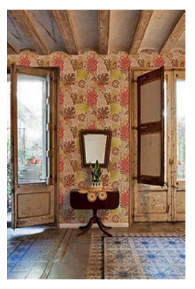
Fig. 2: Typical images from User 1 and User 2 illustrate the decontextualized character of images use in Pinterest