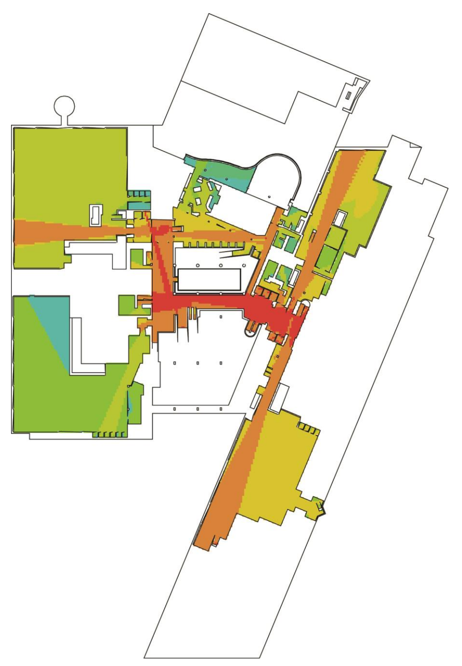
Figure 2: Visualisation of spatial relationships of visibility in the 1<sup>st</sup> floor of the British Library; areas of shorter visible paths through the building are highlighted in warm colours whereas more segregated places are shown in cooler colours

While traditionally, space syntax considers the generic patterns of human behaviour as "relations between configurations of people and configurations of space" <sup>3</sup>, more recent approaches highlight how a configurational theory of space can be adapted for the interpretation of specific cultural and historical contexts. This implies a critique of space syntax theory for lacking sensitivity to temporal processes and focusing on an ahistorical 'generalised individual' <sup>12</sup>. There is also an increasing body of syntactical work addressing spatial practices and the experience of everyday social life <sup>13,14</sup>. Other research emphasises the individual and psychological experience of space through studies of way-finding <sup>15</sup>, examining how the spatial layout has an