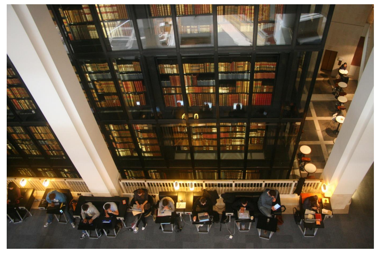
Figure 3: Laptop users in the British Library

segregated spaces. At the weekends, laptop users in general moved to more socially active locations that were again smaller and more centrally located. It was concluded that the building presented a " layered, dynamic and changing experience rather than [...] a definite entity impacting collective user behaviour in one particular way" <sup>17</sup>.