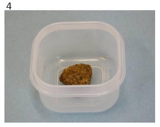
Figure 2. An example of a set of probes: (1) same material, same form (e.g., granulated brown sugar); (2) same material, different form (e.g., brown sugar cube); (3) different material, same form (e.g., sand); and (4) different material, different form (e.g., a pebble).