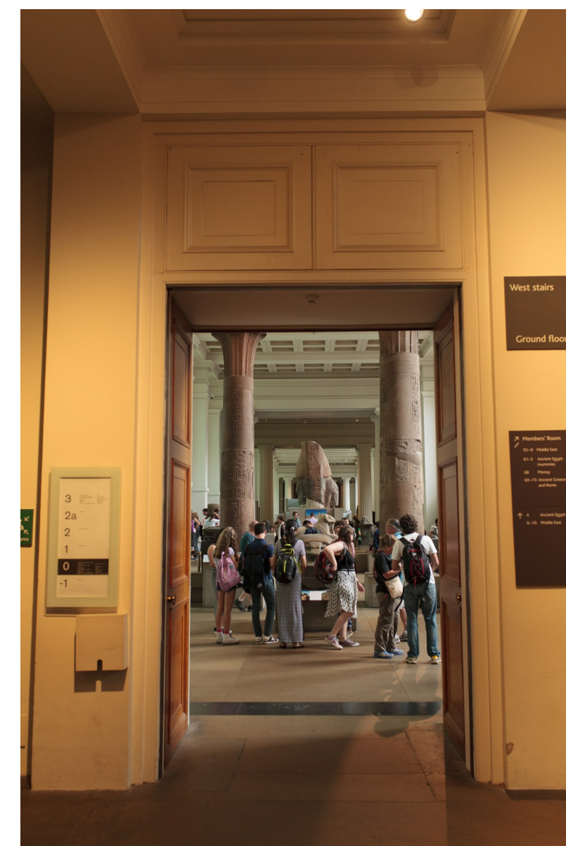
North entrance to Room 4, 'Egyptian Sculpture'.

and large windows, is (unusually and unexpectedly) rather green in colour, its lighting provided by daylight through a glass ceiling. At the opposite end of Room 24 there is a sightline up into Room 33 which is lit by north facing daylight, providing an altogether different reference light. The visual effect of this is a subjective matter, but it could be hypothesized that this lighting situation might lead to Room 24 being viewed as 'dimly' lit, despite light levels which would normally be considered adequate. Observations of visitor movements reveal that visitors tend to focus in the middle of the