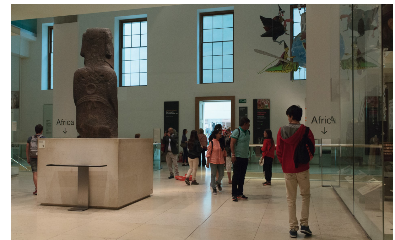
Room 24 'Living and Dying' with illumination from the Great Court visible through the door and windows.

A prime case study of this is in Room 24 at the museum where the ambient artificial lighting is warm (orange/yellow) but the neighbouring space of the Great Court, visible through a door