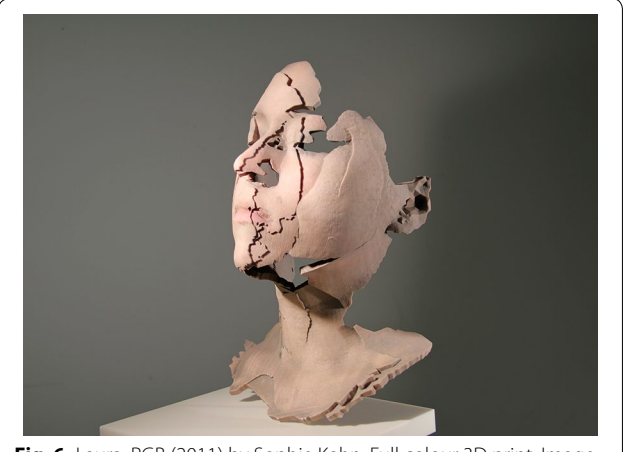
Fig. 6 Laura: RGB (2011) by Sophie Kahn. Full colour 3D print.