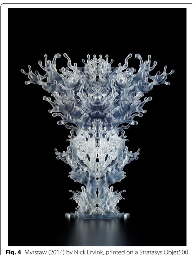
Connex3 Multi-material printer in VeroClear resin.