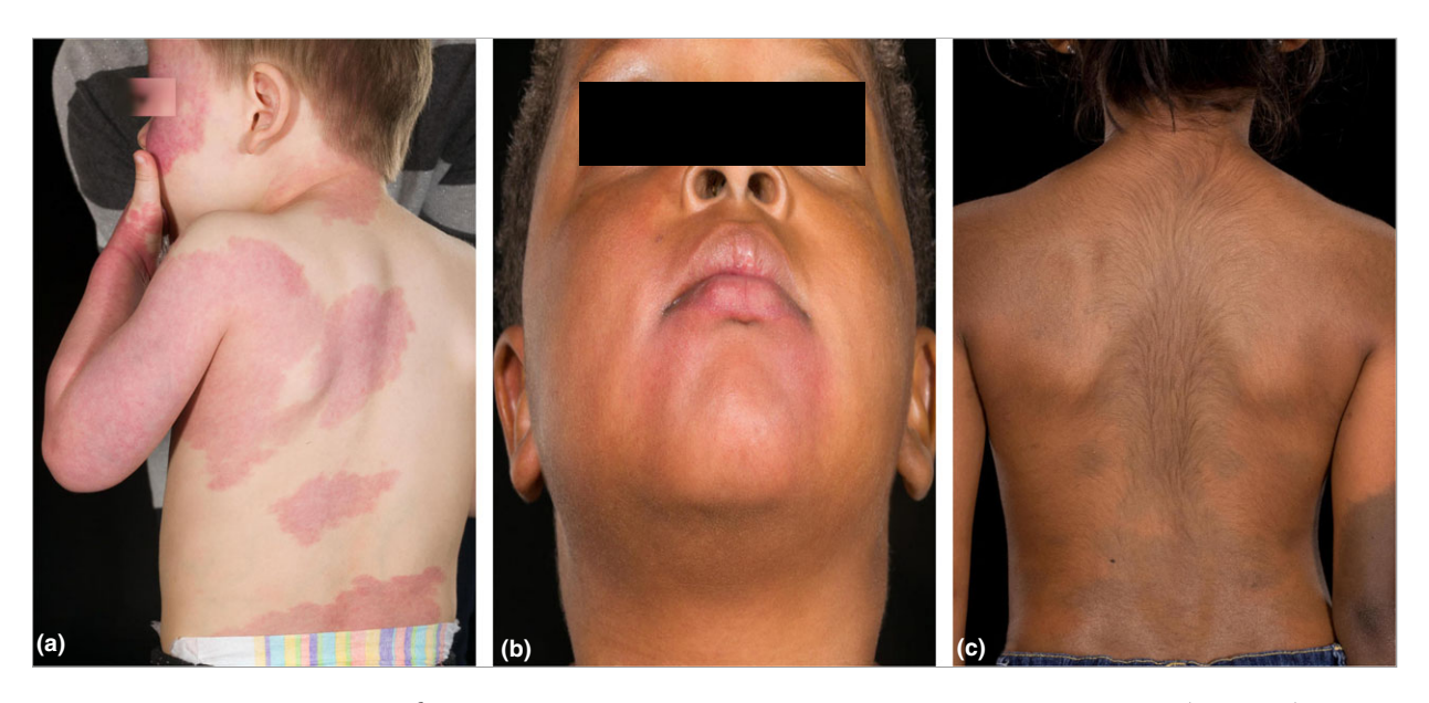
Fig 1. Cutaneous phenotypic spectrum of mosaic G-protein disorders. Patients with identical mosaic mutations in GNAQ (codon 183), presenting phenotypically with (a) Sturge–Weber syndrome, (b) phakomatosis pigmentovascularis and (c) extensive dermal melanocytosis.

Ethnicity data are collected routinely upon attendance at our hospital, where patients and families choose their own