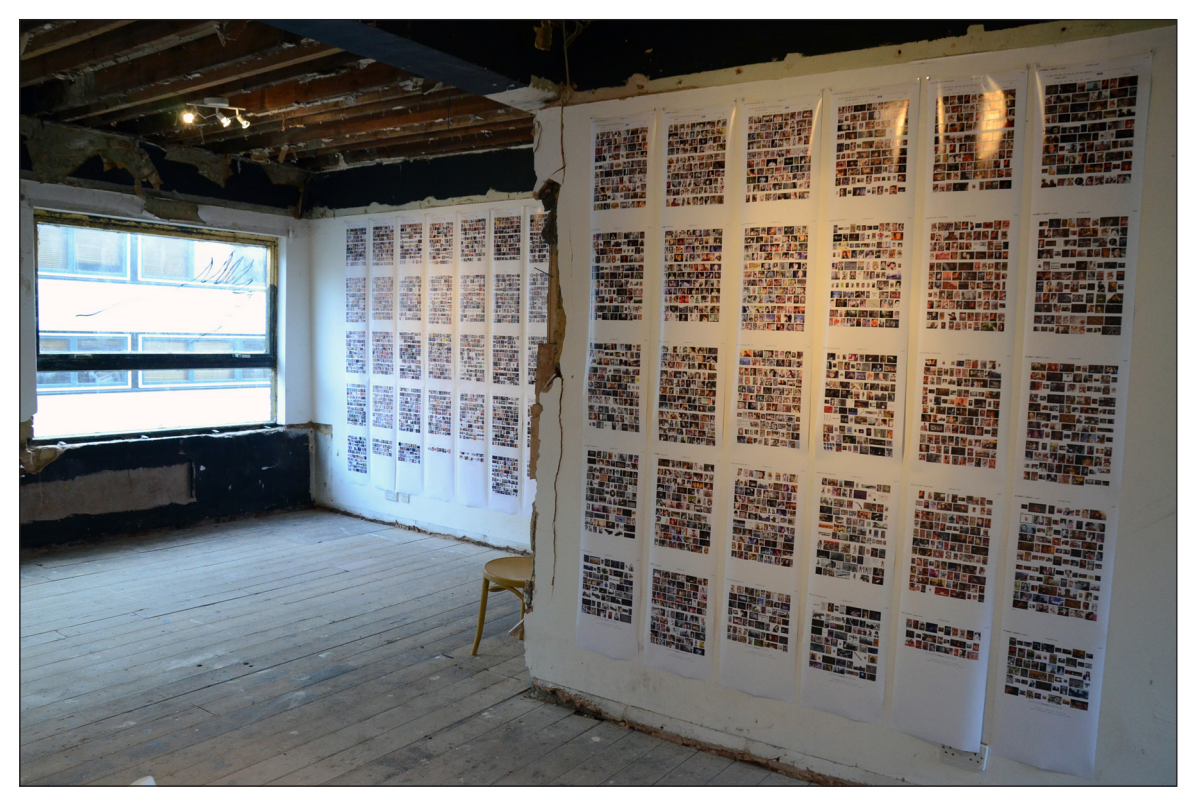
Figure 2: RoCH Fans, (2013), susan pui san lok, 'The Global Archive', Hanmi Gallery, London, 2013.