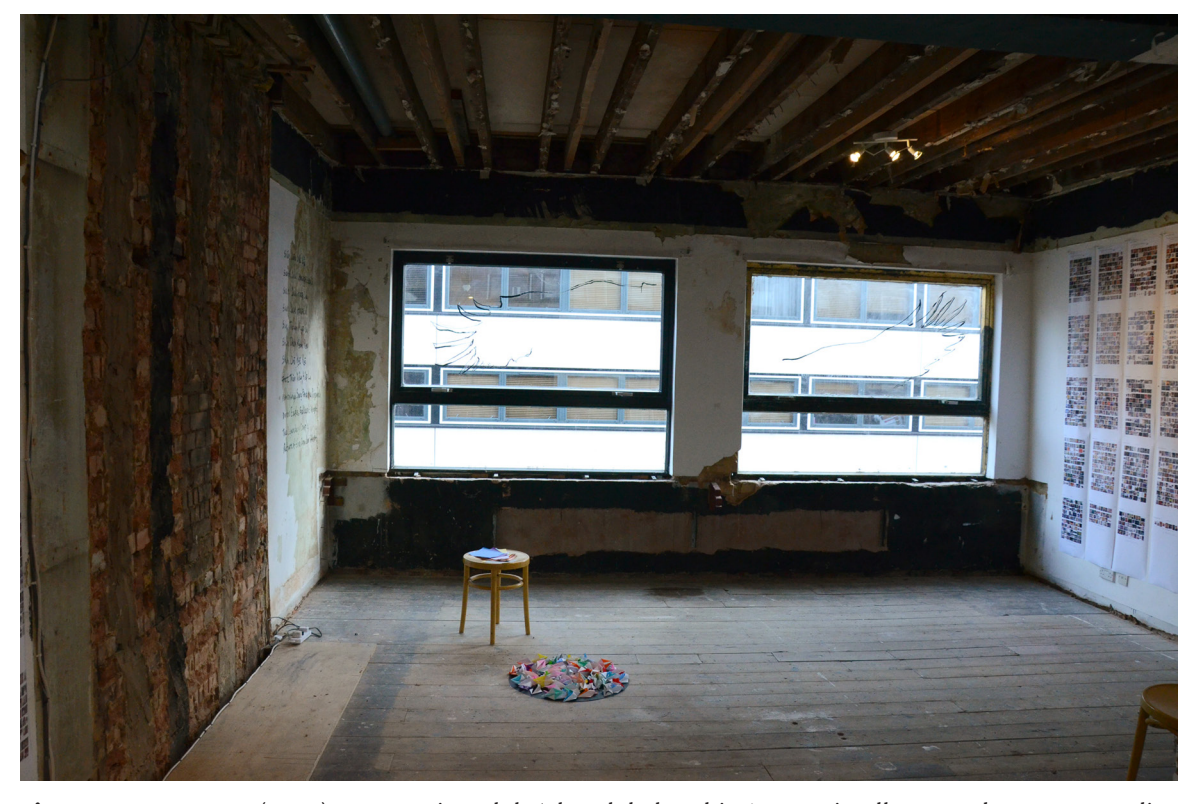
Figure 3: RoCH Fans, (2013), susan pui san lok, 'The Global Archive', Hanmi Gallery, London, 2013. Credits: susan pui san lok.