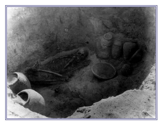
Figure 3. Naqada II burial (c. Naqada IID). El-Abadiya (Diospolis Parva), grave B379.

Such choice in funeral arrangements is also clear from the objects selected for inclusion in the tomb. It was previously assumed that some objects were made specifically for mortuary consumption, such as decorated pottery (D-ware). Examination of use-wear and settlement deposits has demonstrated, however, that this is not the case (Buchez 1998) and that the majority of tomb paraphernalia derived from daily life. Nevertheless, with the benefit of concurrent excavation of cemeteries and settlement at Adaima, it is evident that whilst all the pottery