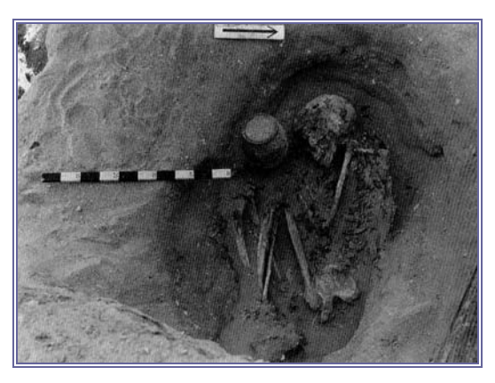
Figure 4. Maadi, burial number 44 (c. 3900 – 3600 BCE).

recorded from the cemetery is attested in the settlement, only certain forms from the settlement were deemed to be appropriate in a (Buchez 1998: funeral context 86). Comparison of the types of flints found in settlement and burial contexts also reveals preferential selection for blades, bladelets, and knives for use in mortuary arenas (Holmes 1989: 333). Palettes may also have been used differently in funeral contexts in comparison to everyday life, with green malachite staining predominant in burial contexts but red ochre more common on settlement palettes (Baduel 2008).