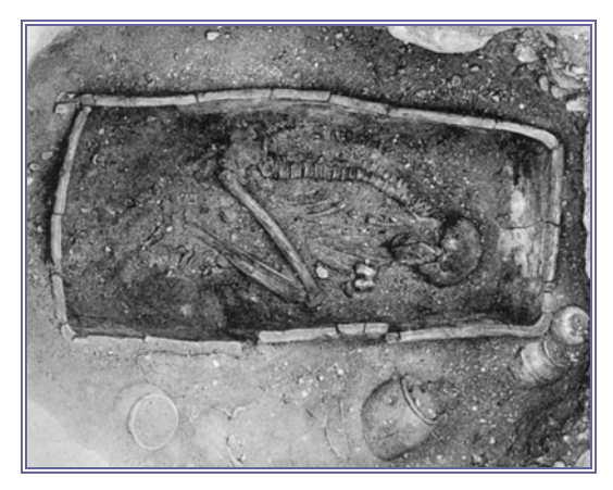
Figure 1. Pottery coffin (c. Naqada IIIA1). El-Mahasna, grave H92.

subterranean tombs is attested at a few sites in late Naqada II (e.g., Tomb 100 in Hierakonpolis), but by early Naqada III, this had been adopted as a standard feature of high-status burials, such as at Minshat Abu Omar (Kroeper 1992: fig. 3). The series of Naqada III brick-lined tombs at Abydos, some with multiple chambers, form direct precursors to the 1<sup>st</sup> and 2<sup>nd</sup> Dynasty royal tombs that extend south from this location.