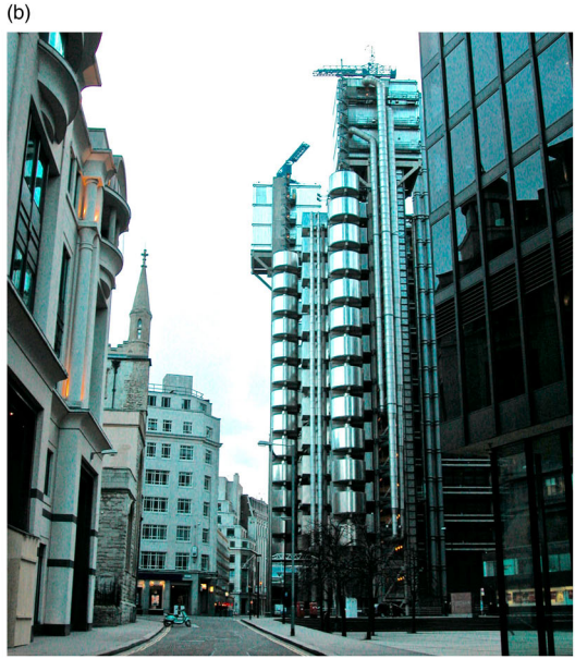
Figure 7. (a) Richmond Riverside (1984) and the (b) Lloyds Building (1979): starkly contrasting architecture, both lauded by the RFAC because of their quality rather than their style.

Christopherson, none of whom believed in rocking the boat. Indeed, with the possible exception of its early years under the stewardship of the 27th Earl of Crawford, guided by the redoubtable Sir Lionel Earle, and again in its later years (the subject of the second paper in this pair), the work of the Commission developed only gradually and was not shaped decisively by the agency of its various chairmen, commissioners, or by the secretariat. Instead, largely unseen by the public eye, the work of the Commission went on without fuss or significant publicity along the lines first established in its early years. In his memoirs, the architectural writer J.M. Richards, who served as a commissioner between 1958 and 1972, went so far as to argue that the Commission suffered from 'an habitual reluctance to come out into the open, to announce its disquiet about any proposal at an early enough stage for public opinion to be effective'. He believed that to rally public opinion, as he had helped to do in the case of the Euston Arch, was potentially the Commission's strongest weapon, 'but too often it preferred to negotiate behind the scenes with, I believe, the idea that it should not antagonise the public authorities it had to work with'.