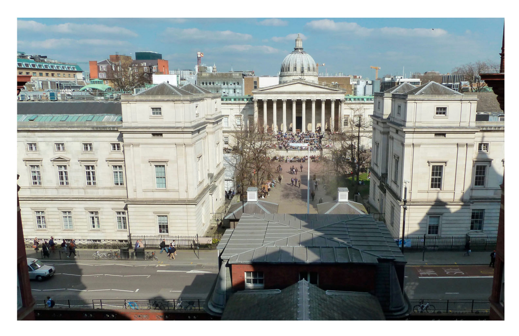
Figure 1. UCL from Gower Street following the RFAC's recommendations.