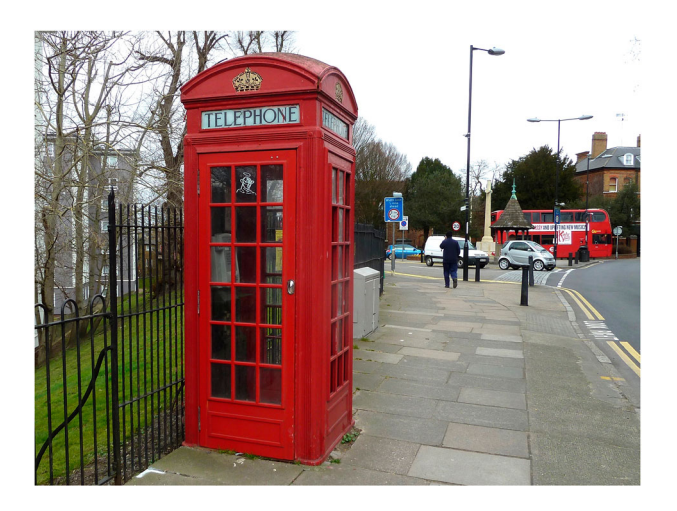
Figure 2. The K2 telephone box, the winning proposal from an RFAC design competition, organized during their first year.

domestic street architecture, no matter what the convenience for traffic. A second was the importance of design honesty. Again, the Marlow Bridge can be used to illustrate the criticism following the Commission's concern that concrete was proposed to be used in a manner that imitated masonry as opposed to one that reflected the innate qualities of the material. The critique echoed a larger concern that had first been raised two years earlier in the Second Report, <sup>34</sup> namely that whilst the Commission strongly favoured the conservation of important townscape qualities (at a time when