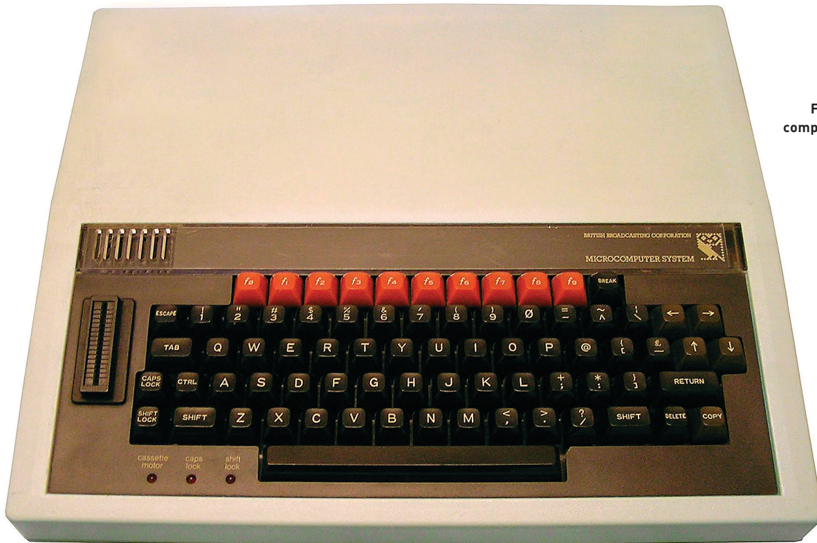
Figure 1. A BBC Micro computer from the 1980s.

received very positive reviews from the teachers and students. The students learned about Arduino-C programming, sensors, and communication, and with this knowledge designed, built, and created a diversity of projects. For example, the children created spelling games and emoticons and recorded their heart rates using the device. Everyone wanted to get their hands on one.