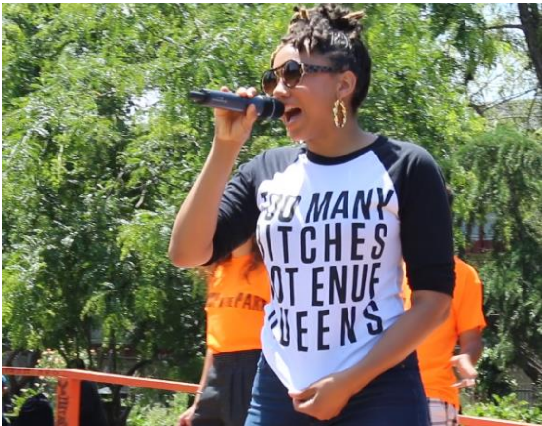
Frame capture from video, by author.