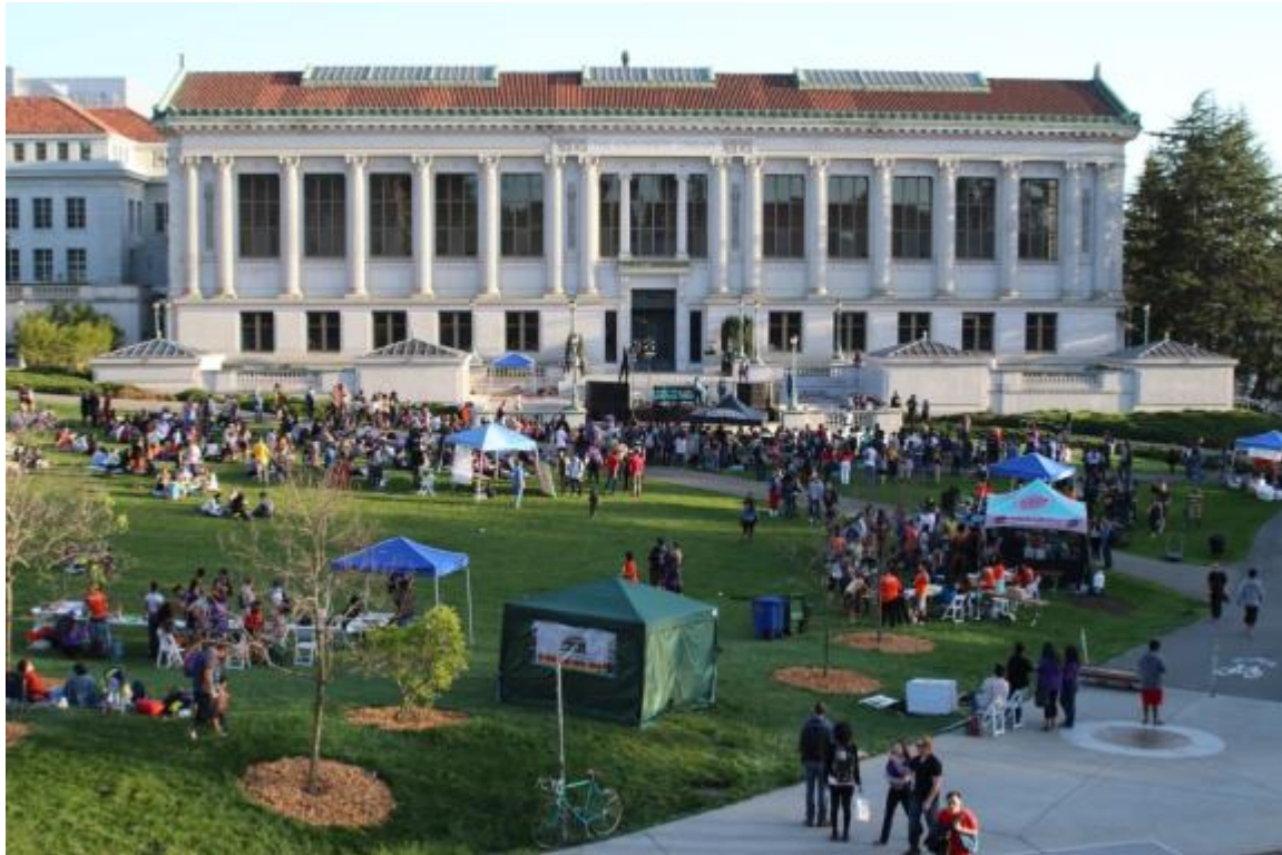
Memorial Glade at the start of NOCR

I arrived quite early, just as the stalls had been set up. The friend with whom I had walked over to the Glade linked up with a colleague from his business club and left to go throw a football. His colleague's friend, a young woman, was impatiently watching the stage set up, anxious for Blue Scholars to come on (she had a few hours to wait). As I was setting up my camera and audio recording equipment, a Native American came on stage to share a traditional song with the small crowd that had formed. As the man began singing, the woman next to me continued to look bored. She groaned and lamented the performance: 'I just want Blue Scholars, why am I listening to this?' I told her I was quite interested in all the different events that they had set up for NoCR and she advised me to check out the tents that were set up for 'raffles' and 'face painting'. She told me this just as the man had finished his song saying that he wanted to thank everyone coming out to NoCR to celebrate 'diversity on this campus and in the state'.