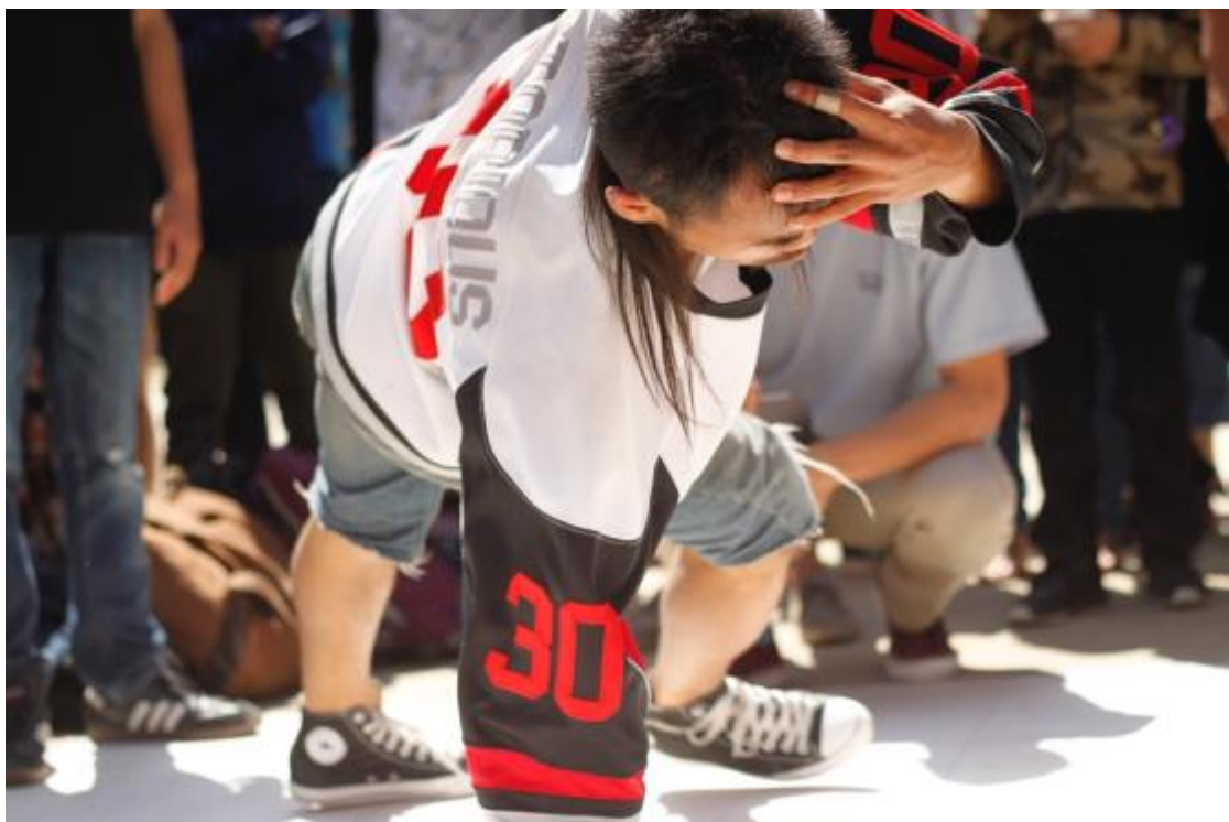
Dance cipher at HHIP, photo by Avichal Agarwal.

In addition to graffiti, an important element of hip-hop culture, HHIP also featured hip-hop dance. Near the north end of the park by a pair of basketball courts S4HH had set up a dance cipher, where students and local hip-hop dancers performed. At times it was busier than the stage. The dance cipher works as a cipher of rappers, though they dance in the centre when it is their turn rather than rap. 16 The dance cipher provided a space for an associated student group of breakers (who practice breakdancing, a form of hip-hop dance) to perform and share hip-hop dance with audiences as well. The dance cipher drew a diverse crowd and offered a free, open space to learn about other aspects of hip-hop culture beyond rap, DJing and music.