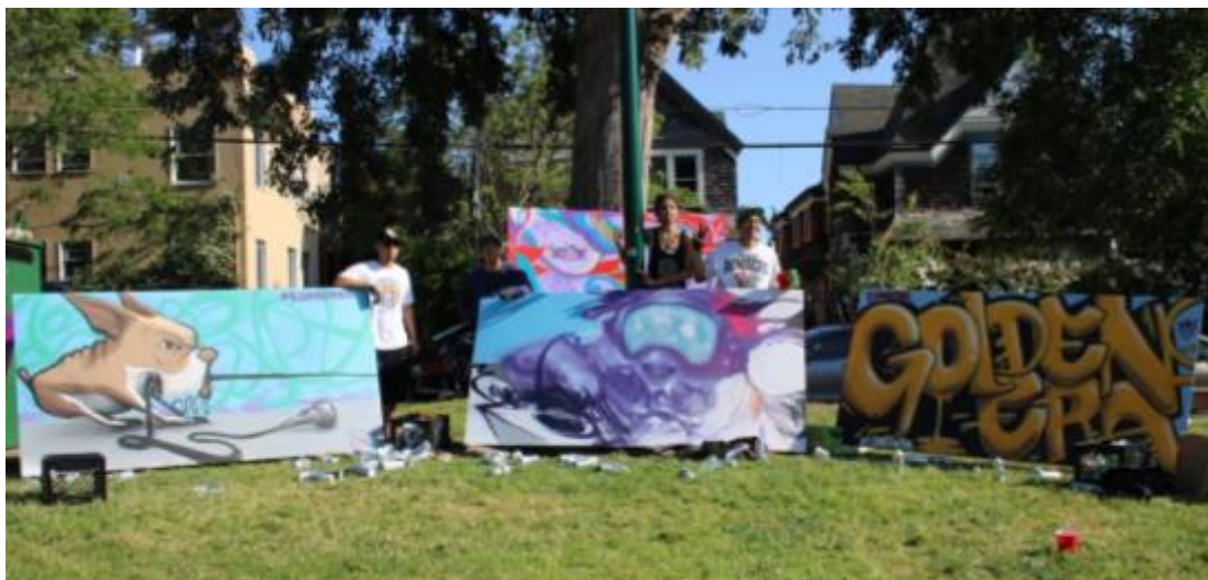
Illuminaries artwork at HHIP