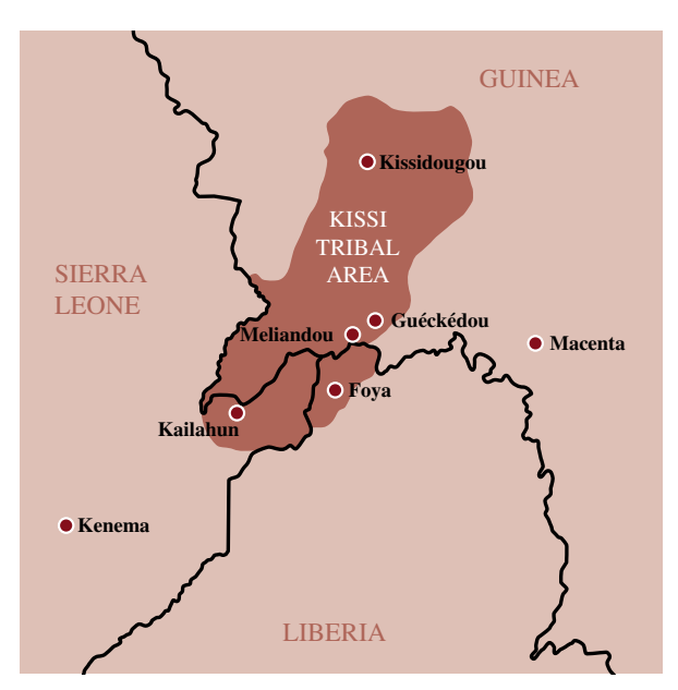
Figure 4. Where the outbreak began—map to show Kissi tribal area spanning Guinea, Sierra Leone and Liberia. (Online version in colour.)

had the greatest potential impact of all interventions on outbreak prevention [111]. Despite this, repeated assessments revealed widespread risks in funerals including a lack of trained burial teams, a shortage of burial space, no clear guidelines on collecting diagnostic specimens from the deceased, and a lack of community engagement to facilitate culturally acceptable safe burials [112].