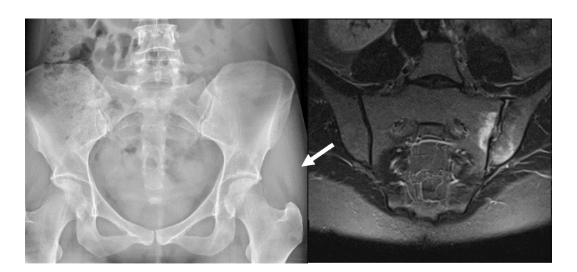
Figure 3: Left SII in a patient with strongly positive CCP antibodies and inflammatory spinal pains (pseudo widening of the joint space and bone irregularities of the left SIJ on conventional radiograph and bone marrow oedema affecting both sides of the joint on post-contrast MRI).