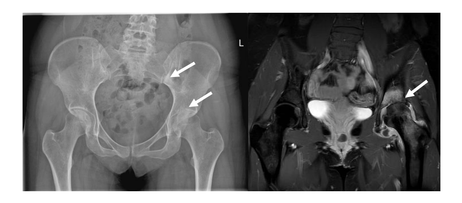
Figure 4: Left hip arthritis with significant joint space narrowing and left SII associated with bone sclerosis on conventional radiograph, and massive synovitis on MRI (post-contrast) in a patient with strongly positive anti CCP antibodies.