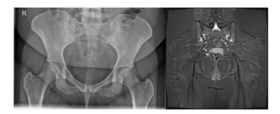
Figure 1: Bilateral SII (joint space narrowing and sclerosis on pelvic Xray and bone marrow oedema on MRI) in a patient with symmetrical polyarthralgia, in the context of previous diagnosis of RA associated with strongly positive anti CCP antibodies.