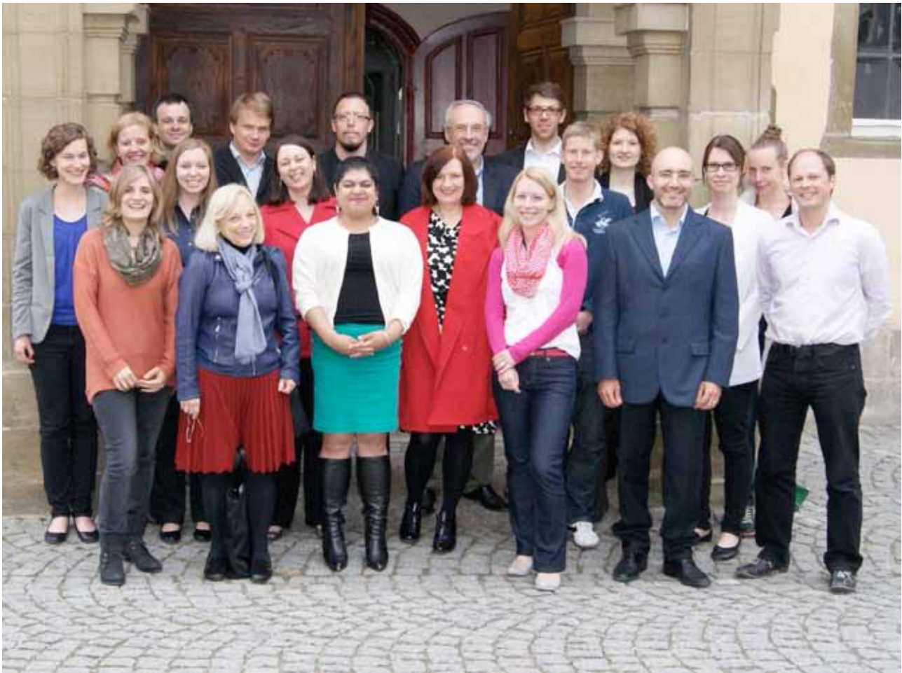
PATHWAYS 9th workshop in Tübingen, Germany in May 2013