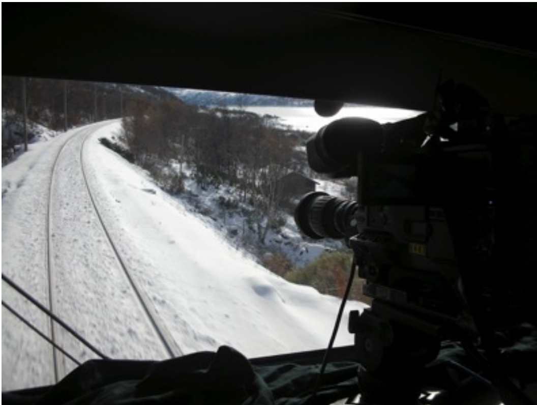
Image 1: Filming the route ahead in Bergensbanen minutt for minutt ( Bergensbanen Minute by Minute , 2009)