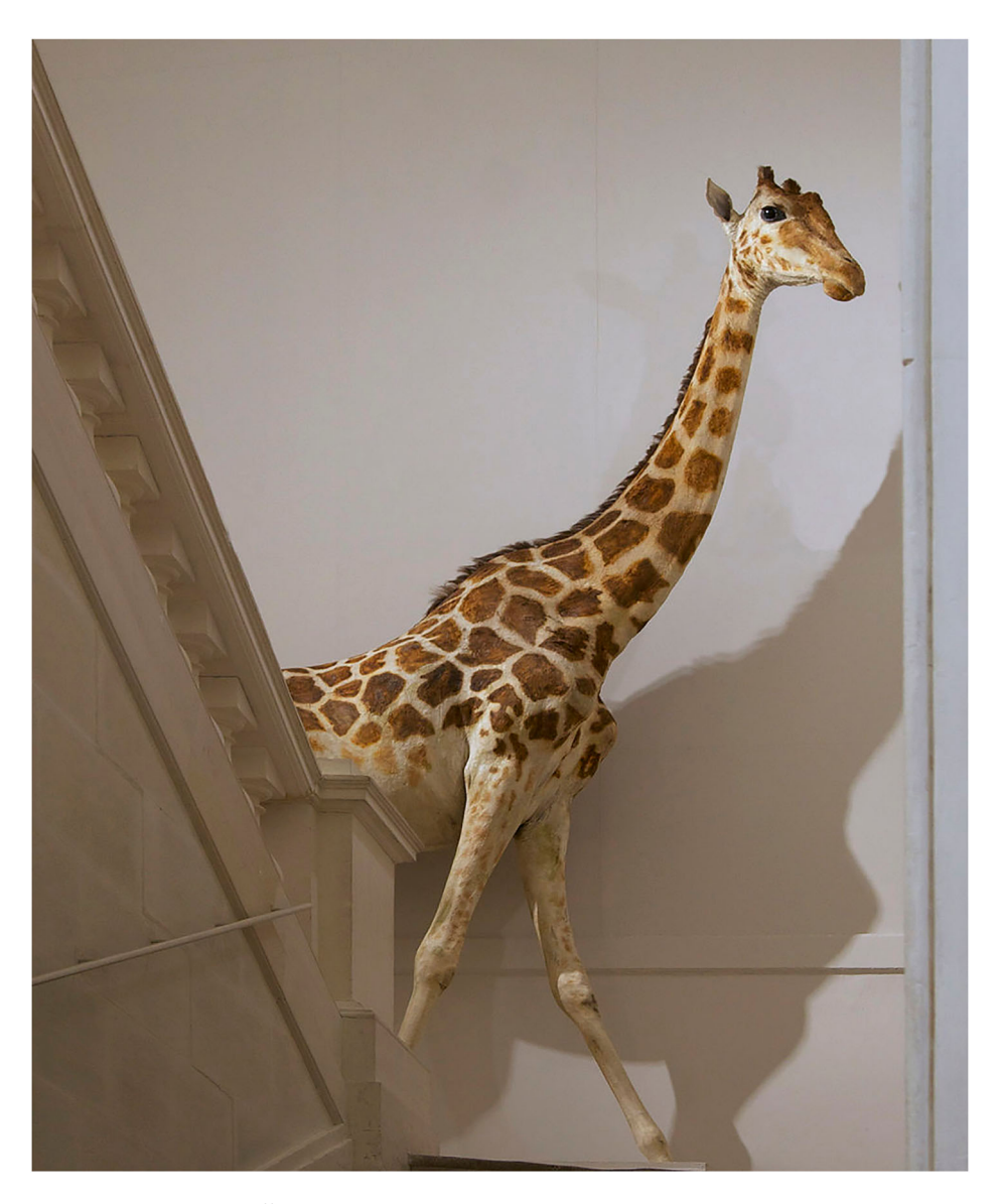
Figure 1. The French giraffe in a stairwell in the Muséum d'histoire naturelle de La Rochelle. Creative Commons public domain licence CC0 1.0.

The French giraffe (see Figure 1) was transformed into an even greater celebrity through being displayed conspicuously. After landing in Marseilles she walked the 880 kilometres to Paris, with crowds of people lining the road to see the spectacle of her, 68 sometimes clad in a special made coat bearing the French royal fleur de lys on one side and the arms of Muhammad Ali on the other, <sup>69</sup> thereby signifying exactly her purpose