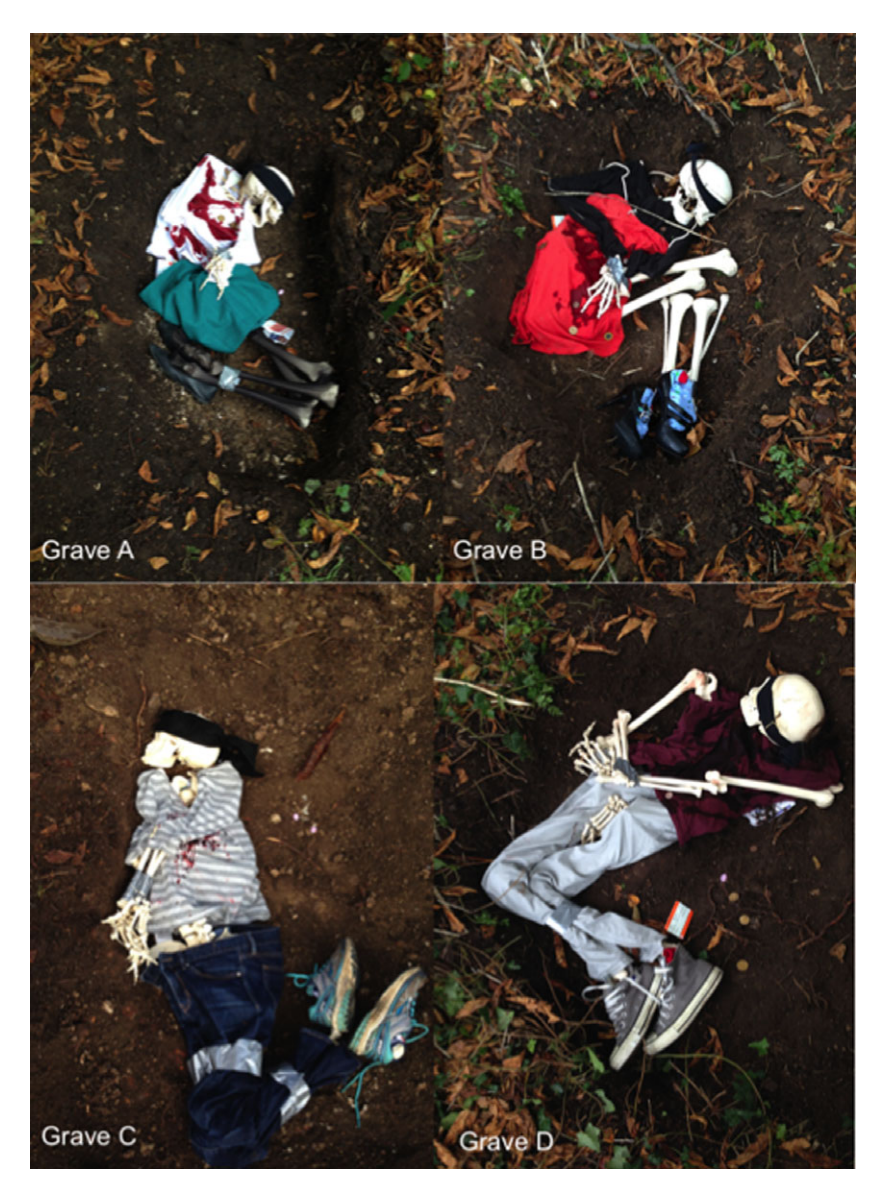
FIG. 1-Graves a and b are skeletal male casts with female clothing, and grave c and d are skeletal male casts with gender neutral clothing.

course, with previous background knowledge of forensic anthropological/osteological assessments, were further asked to take part in the subsequent forensic anthropological analysis postexcavation. This was set up in a mock mortuary facility. The participants were told that this was a mock mortuary exercise following the excavation, and to focus solely on the assessment of the skeletal remains.