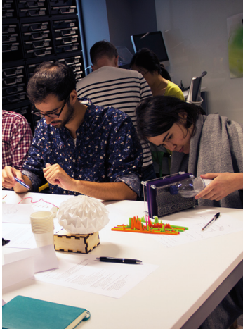
Figure 3: An impression of the co-creation session.