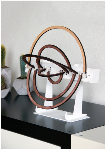
Figure 4: The final design of LOOP .