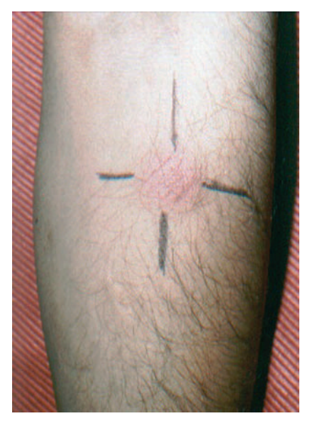
Figure 2 Forearm showing positive Mantoux reaction.

palpation. The prostate was normal on rectal examination.