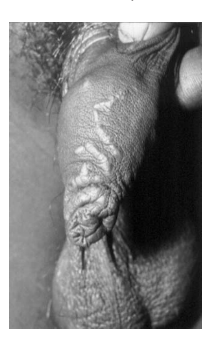
A linear serpentine lesion seen Figure 1 extending from the tip of the prepuce on to the

Cutaneous larva migrans (CLM) is a distinctive cutaneous eruption caused by the invasion and migration of larva of parasites in skin.1 It is also known by various other