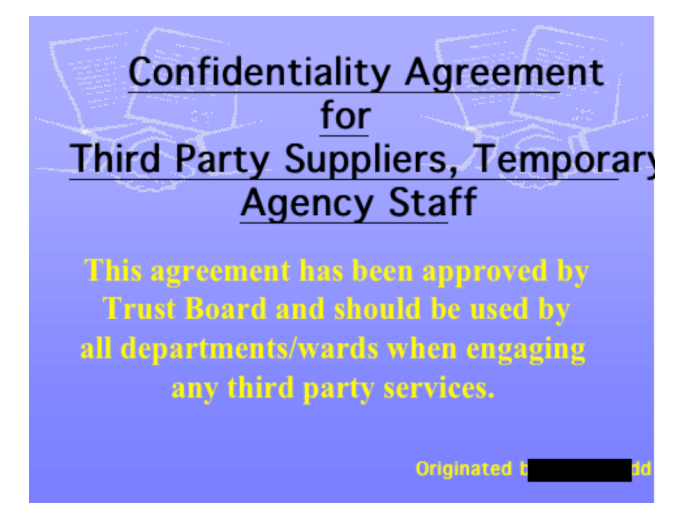
Figure 1. Privacy screen saver.

by a hospital working group whose remit was to improve staff working facilities. This was the first time the working group had been involved in any IT development. A selection of screen savers were then chosen and put on the system. However, after a period of time user complaints still arose about these screens, e.g. "what do I want to look at somebody's holiday snap for and what do I want to look at this and that for" (Screen Saver Development Team). It was then decided by the screen saver development team that the resource would become an information board. There was a marked decline in complaints after this point and a dramatic increase in user involvement. Initially the application cycled through IT security advice screens (see fig 1) e.g. securing personal data, incident reporting etc.