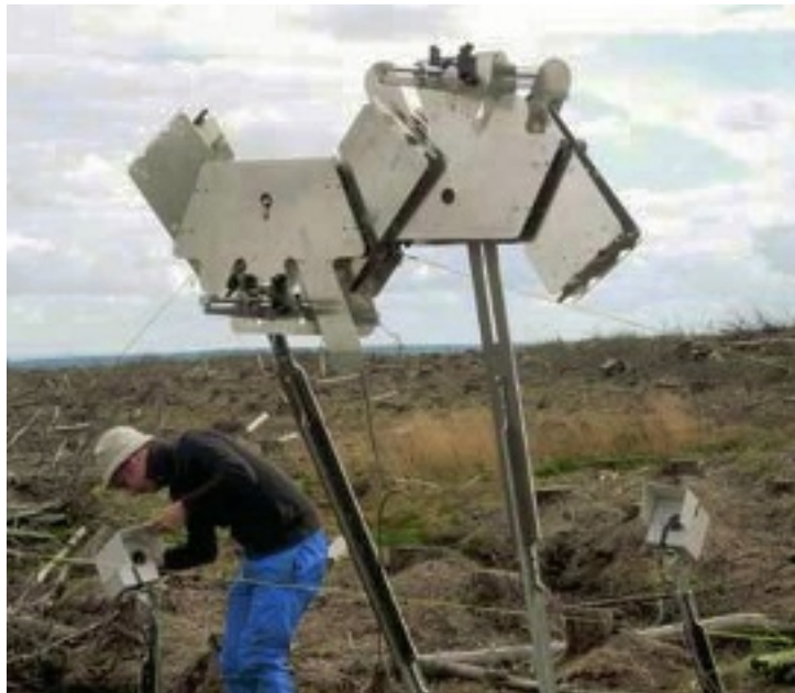
Top: Solar heating data

THE ARCHITECT'S DESIGNS ARE BEING DRAWN DIRECTLY INTO THE CONSTRUCTION PROCESS AS NEVER BEFORE. AND, IF THEY DON'T FULLY UNDERSTAND AND TRANSCEND THE PROCESS, THEY WILL BE CONSIGNED TO BEING A SIMPLE LINK IN THE PRODUCTION LINE.