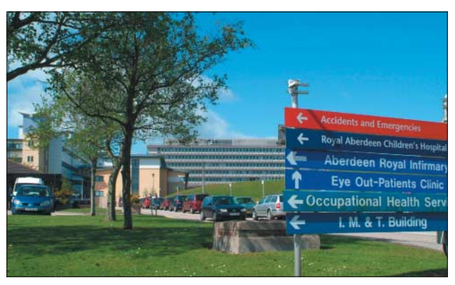
After discharge from hospital with an exacerbation of COPD, most patients should be reviewed at the hospital outpatient clinic