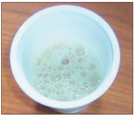
Consider giving antibiotics when sputum is purulent and of greater volume than usual