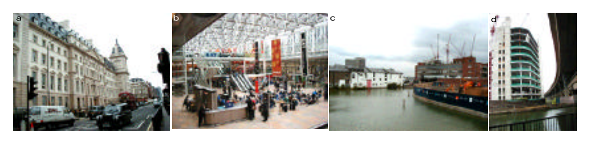
Figure 1.11: Paddington Station area