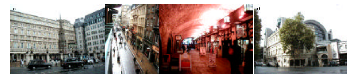
Figure 1.4: Charing Cross Station area