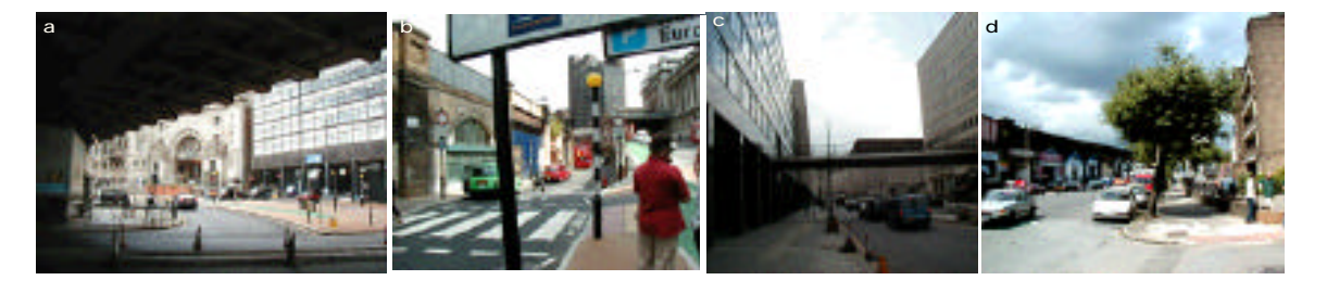
Figure 1.10: Waterloo Station area