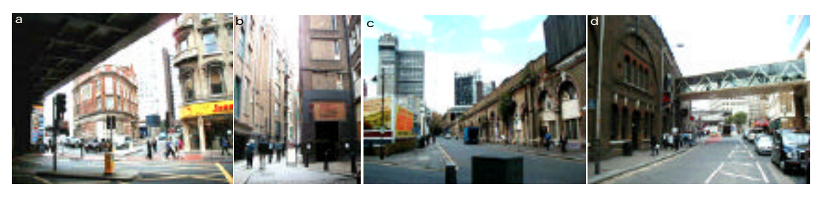
Figure 1.8: London Bridge Station area