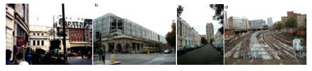
Figure 1.7: Victoria Station area