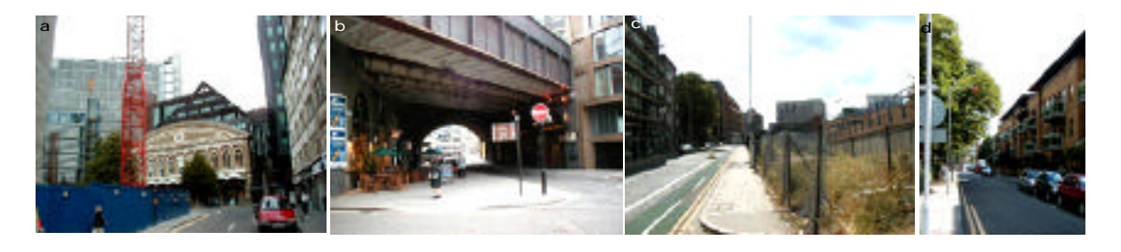
Figure 1.9: Fenchurch Street Station area