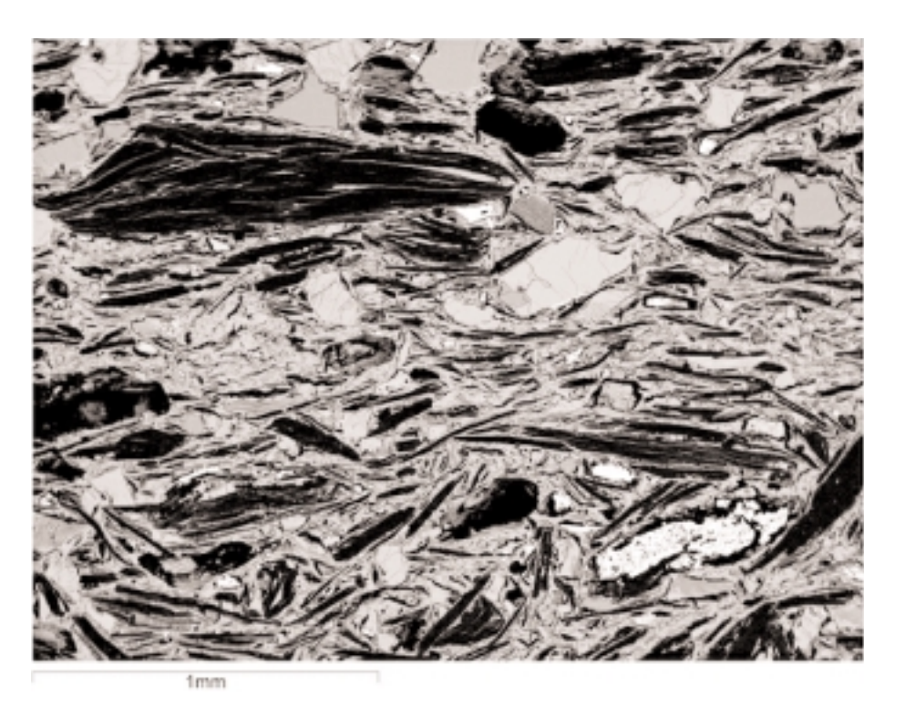
Figure 3. Backscattered electron image of a dark Bavarian crucible, showing abundant graphite speckles (black) as well as some silicate inclusions.

Torres et al 2003). Furthermore, graphite is not explicitly mentioned at all until the late 17<sup>th</sup> century (and even then it is referred to as Wasserbley or "liquid lead", still denoting an atypical understanding). In this sense, perhaps the better performance was originally related to the external quality, much more in line with the Renaissance mentality. Only by repeated experience, and through feedback between manufacturers and users, the link between graphite and good performance would have been fully realised. This would explain the concern with appearance, as all the crucibles produced in the region, graphitic or not, show a very smooth surface finish and black surface, resulting from a deliberately smoky firing.