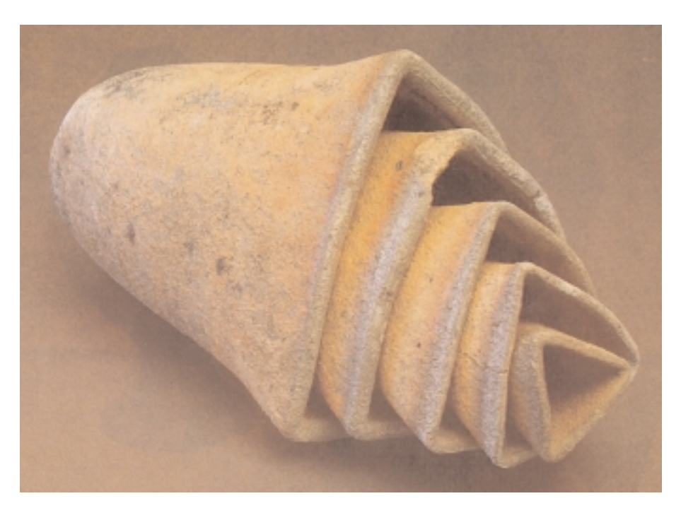
Figure 1. "Nest" of triangular crucibles recovered in Hesse.

comprehensive picture of this scenario and establishing the technological, historical and archaeological implications of this vessel type (Martinón-Torres 2005). Three basic questions were posed: (1) what is the "mystery" that made these crucibles so highly esteemed? (2) does the standard appearance of the vessels respond to a standard manufacture? and (3) were these crucibles primarily traded or was the triangular shape simply adopted progressively in different regions?